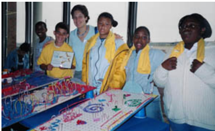
LASI youth at the Museum of Science

provide a whole brain learning approach to twenty students which identify youths' skill strengths and learning styles, and build these skills through academic and vocational programming to stem poverty, school drop out rates, violence and hopelessness in the local Latino community. As part of a grant from the National Science Foundation, Club Latino served as a pilot site for The Intercultural Center for Research in Education (INCRE) to integrate math and science with technology in an after school setting. A generous grant from the Grand Circle Foundation allowed La Alianza to provide additional parent workshops and support services.