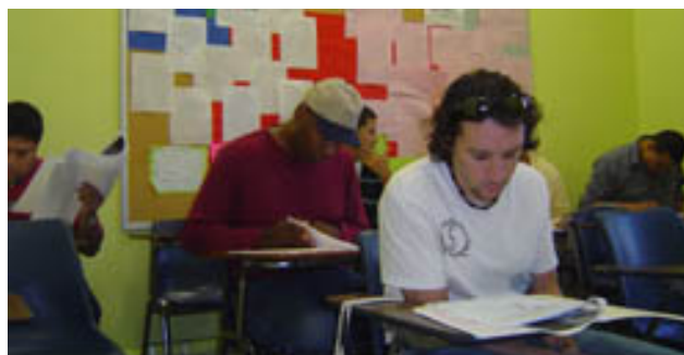
PACE candidates in an orientation & training session at La Alianza Hispana

PACE: The Partnership for Automotive Career Education Training and placing automotive technicians and supporting them in their careers.